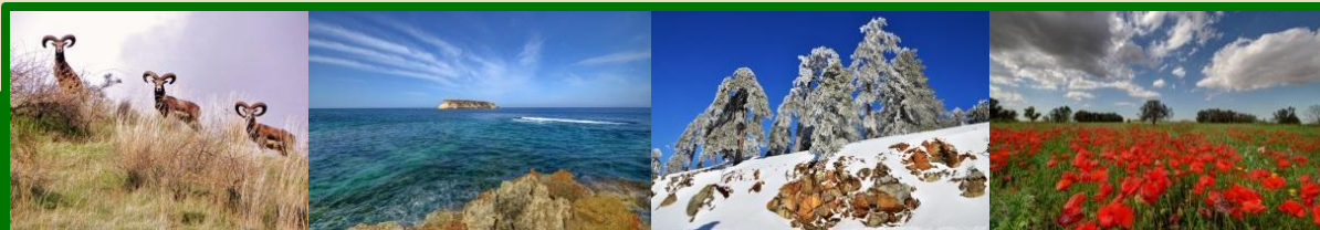
Cyprus through the seasons.

Exciting Pre-Conference half-day Workshops are taking place online with live streaming on July 13 th , 2021. The pre-conference workshops are approved both by ISPA and NASP (National Association of School Psychologists) making them, thus, eligible for Continuing Education credit for USA-based participants. Limited openings available for each workshop. →