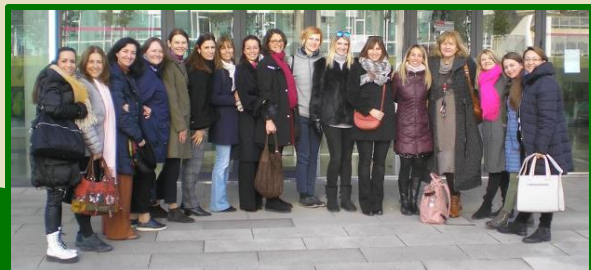
Fourth Partners' Meeting in Rijeka (Croatia)

The curriculum includes differentiated activities for students from kindergarten to secondary school, aimed at strengthening their personal and interpersonal skills (e.g. Social and Emotional Learning skills and resilience) and at reducing